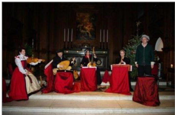
The five musicians at Wolverton Manor.